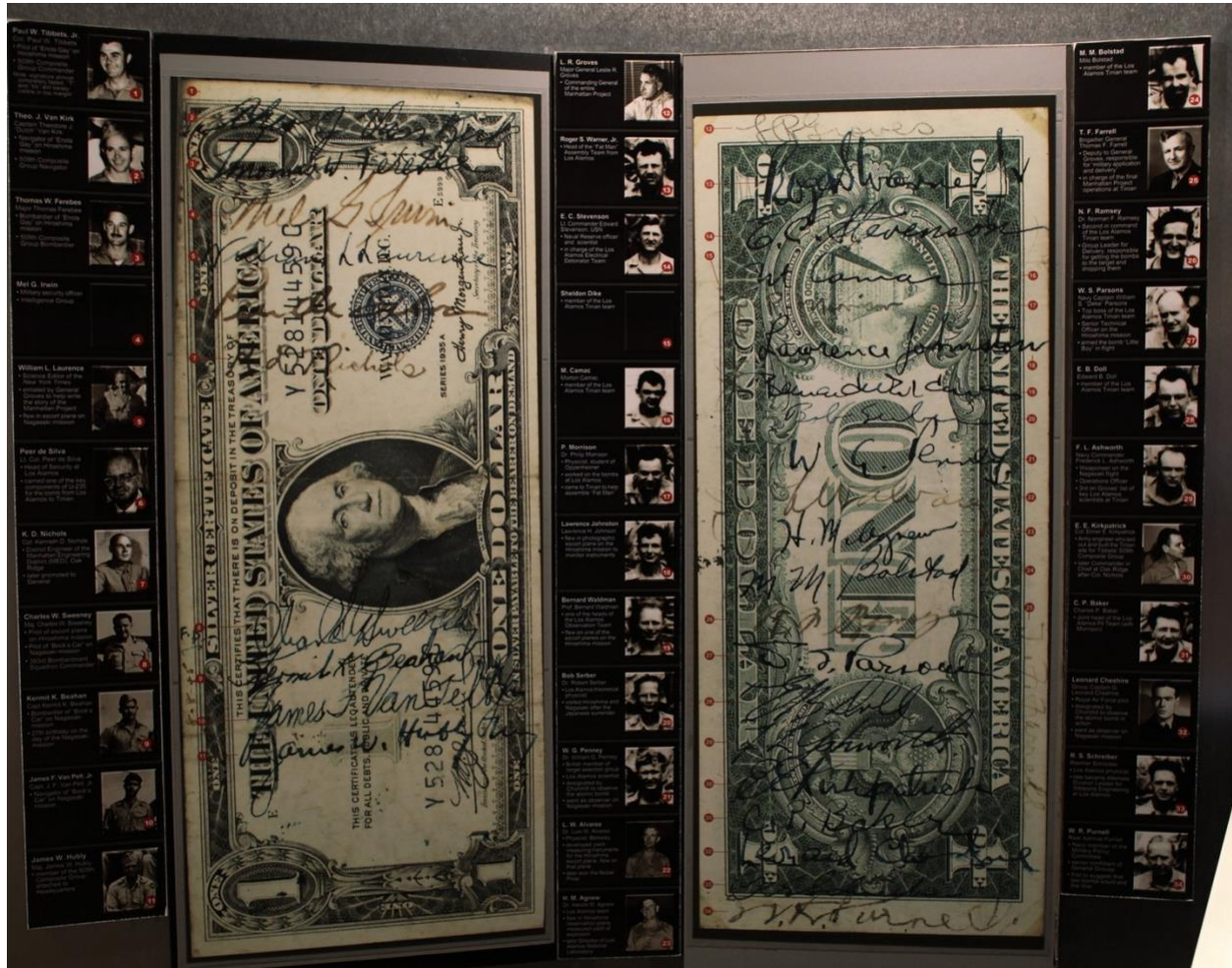
Dollar Bill signed by 34 men involved with the dropping of the bombs over Japan, including Paul Tibbets, Jr (1 st signature on face of bill), K. D. Nichols (6 th), L. R. Groves (1 st on backside of bill), and F. L. Ashworth (18 th).

(As published in The Oak Ridger's Historically Speaking column the week of April 28, 2025)